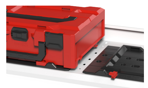
Universal Adapterplate for any Shelve