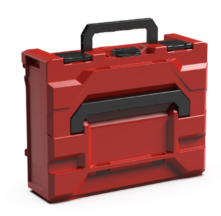
metaBOX 145 M External dimensions: 446 x 345 x 145 mm Inner dimensions: 429 x 317 x 110 mm Weight: 1.95 kg