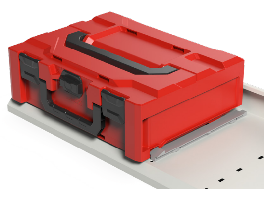
COMPATIBEL TO SORTIMO RACK SYSTEM